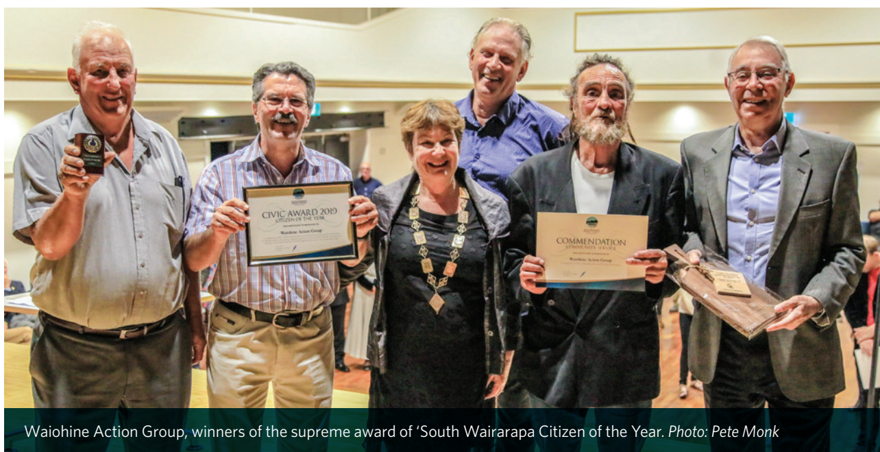
Waiohine Action Group, winners of the supreme award of 'South Wairarapa Citizen of the Year.